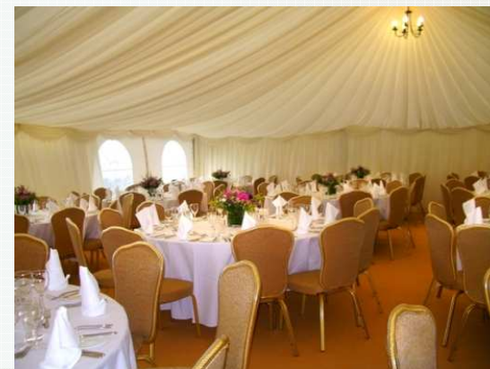
Memorable Marquee Weddings