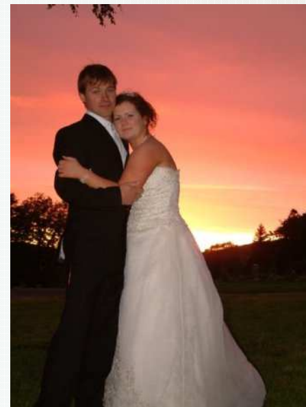
Sunset at Kippure Estate