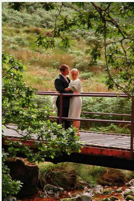
The River Liffey, Kippure Estate

Welcome to Kippure Estate... a truly unique wedding venue.