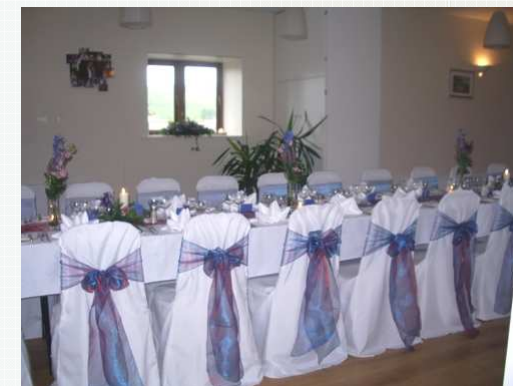
The Belfry for intimate dining