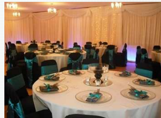
Your wedding reception in our Cransillagh room