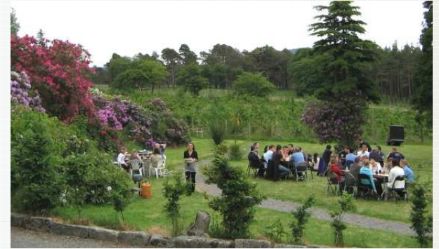
Mouth watering BBQ's